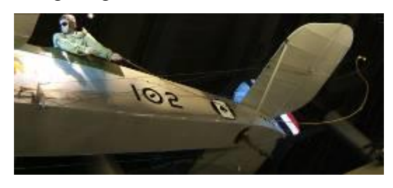
USMC Aerial Pickup in 1927

One hundred years ago last April, Harper's Magazine imagined, "The aviator in need of supplies may someday signal his wants, lower a trailing line, and pick up gasoline by some such a device as we now employ to catch mail-sacks on express trains." Perhaps this inspired Godfrey L. Cabot in 1918 to trail a line to pick up a package in Boston Harbor, and later a gas can. Lytle S. Adams similarly exchanged ship-to-shore mail with the Leviathan sixty miles offshore in 1929. But in 1927 U.S. Marines in Nicaragua first snatched a rope looped between two vertical poles to pick up a message bag.