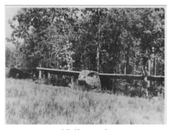
LZ Chowringhee

The CBI innovated in all mission categories. An exercise demonstration snatched mules going in, and then showcased snatch pickup when the LZ flooded. Operation Thursday flew a replacement bulldozer by overweight snatches in from LZ Broadway to build LZ Chowringhee, and then out. The waiting Lt Col Clinton Gaty risked daylight discovery to keep the Chowringee gliders rather than bury them in pieces.