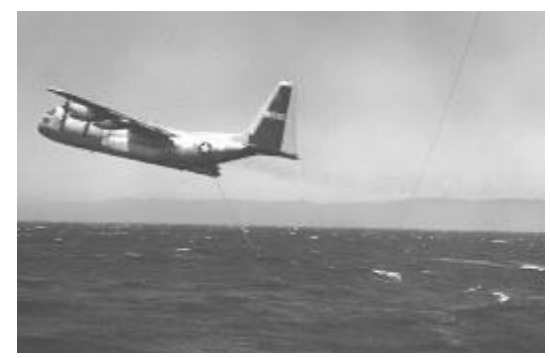
Ship Trailing Line Snatch Pickup

worked in a storm as Col Harlan "Bud" Gurney (USAF Ret.) and Chuck Dorigan can attest, yet balloons still replaced the sea anchor for mid-air intercept in the STARS and Fulton systems. Helicopter and wireless telemetry also matured. Today only advertizing banners are snatched. I imagine future cargoes autonomously snatched from ships at sea for inland delivery.